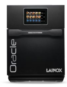
ORACBS - ORACBB