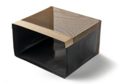
OWB - ORACLE WASHABLE BOX Special removable, non-stick, Teflon oven box.