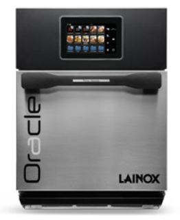
ORACGS - ORACGB