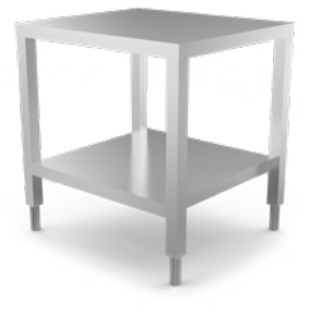
STAND Stand with bottom shelf, for one or two ORACLE ovens, with adjustable feet or on wheels.